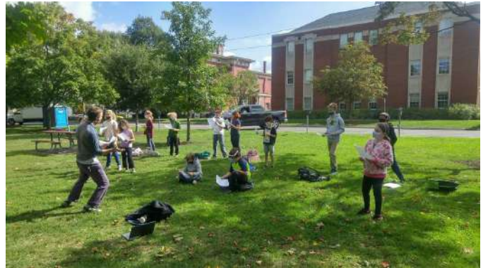
The Apprentices sang the Fifty states song on the Diamond.